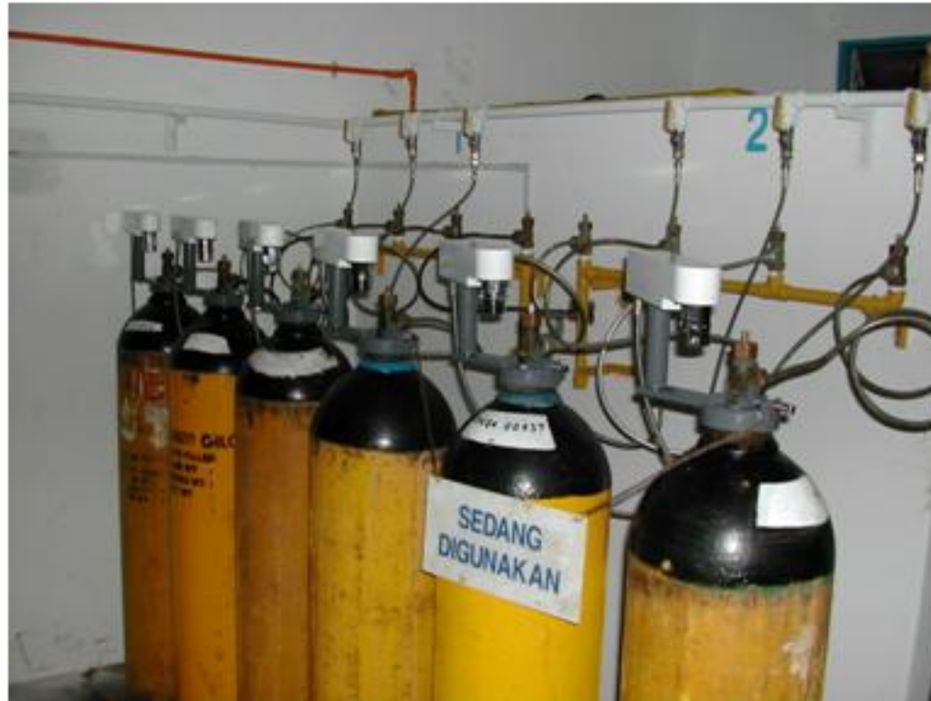
MaxGuard Systems at Tasik Chini Water Treatment Plant, Pahang. 6 chlorine cylinders closure system